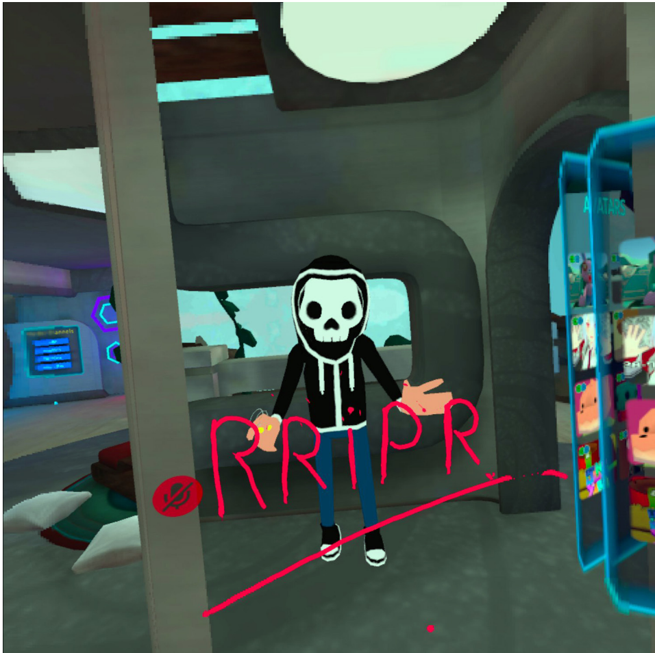
Fig. 1. One of the Author's avatars as seen in the mirror of the default home world in VRChat

VRChat is one of a range of social VR platforms – with other examples like AltspaceVR, Rec Room or Facebook Spaces. Since 2018 these applications have become more popular among VR users due to their increasing sophistication.