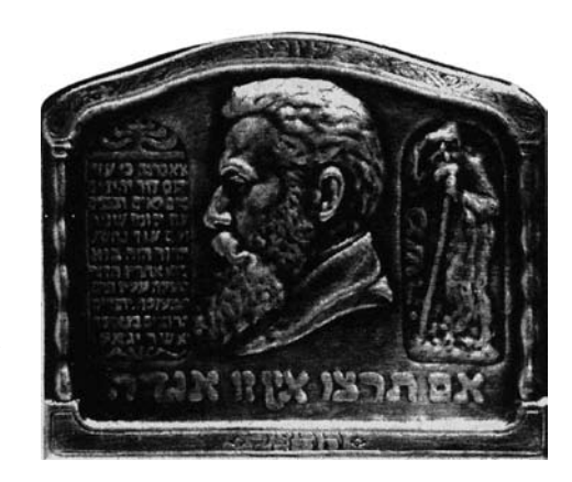
Fig. 8. Yizkor (medal-plaque commemorating Herzl's death) by Borys Schatz (1907, bronze)

at the right time to follow the Nietzschean call to overcome the 'old' time. In so doing he would begin a radically new history that would sweep away the maladies of the new and old ghettos and overcome the syndromes of marginality and tradition" 61. One should add that Herzl's cultural-social experiment would gain the following of the masses.