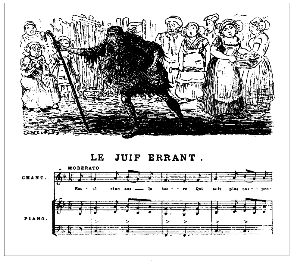
Fig. 3. "Le Juif errant", a French postcard, late 19<sup>th</sup> cent.

otypical imagery of contemporary Jews (most frequently Ostjuden) as a negative representation of the European Jewry<sup>24</sup>.