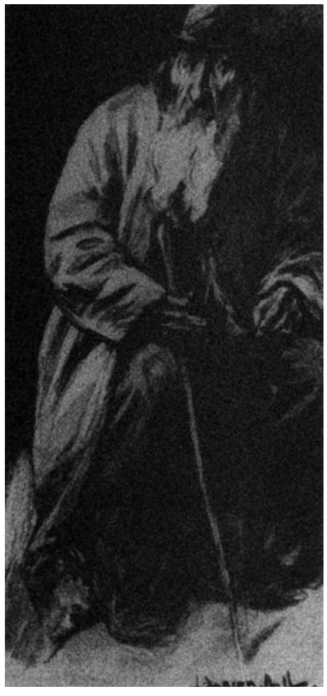
Fig. 2. A study of an old Jew, late 19<sup>th</sup> cent. Source: Eduard Fuchs, Die Juden in der Karikatur: ein Beitrage zur Kulturgeschichte, Albert Langen, München 1921

pearance, which the Western Europe saw as strange, defined by the term of "Munchhausen syndrome" — as a consequence of permanent existential insta-