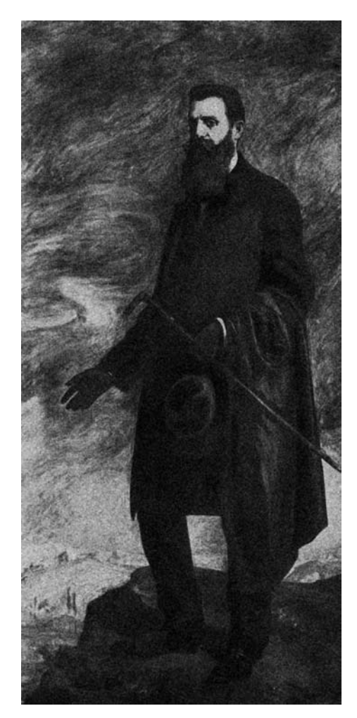
Fig. 1. "Herzl", portrait by Leopold Pilichowski (oil on canvas) (1908), (missing).