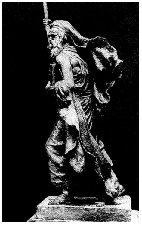
Fig. 4a, b. "Ahasverus" by Alfred Nossig (sculpture).

cover of the first issue of the periodical (1901), bore an illustration showing Alfred Nossig's sculpture of Ahasverus from 1900. In July that year, the magazine published a reproduction of E.M. Lilien's Ahasverus , the Heimatlos , with a walking stick and a sack on his back, while in October 1902 its pages featured Ahaswerus ( Der Ewige Jude ) by Samuel Hirschenberg (fig. 5) and in November the same year — a work by Julius Cohn<sup>39</sup>.