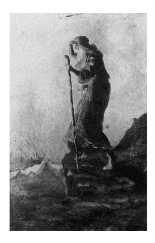
Fig. 7. "Moses on Mount Nebo" by Borys Schatz (1904) (oil on canvas).

the artist, being rather a reflection of the historical Judaeo-Christian relationships. The mark of the cross on the forehead, an iconographic motif assigned to Cain, functions here as a suggestion of the negative Christian projection of that character. Cain is a pre-figuration of Ahasverus (i.e. Jews), who features in the Christian iconography (as well as in Talmudic Jewish literature)<sup>44</sup> as a stigmatized figure, i.e. "marked" in a mysterious way by God — a figure whose body received a mark<sup>45</sup>.