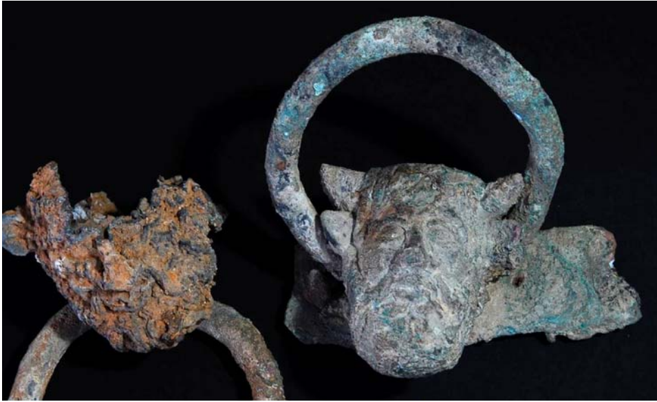
Fig. 7. Two large palace's door knockers from Rhizon