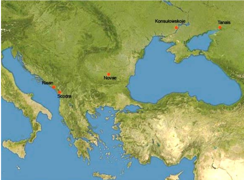
Fig. 1. Localisation of Rhizon and Scoder, A. Momot