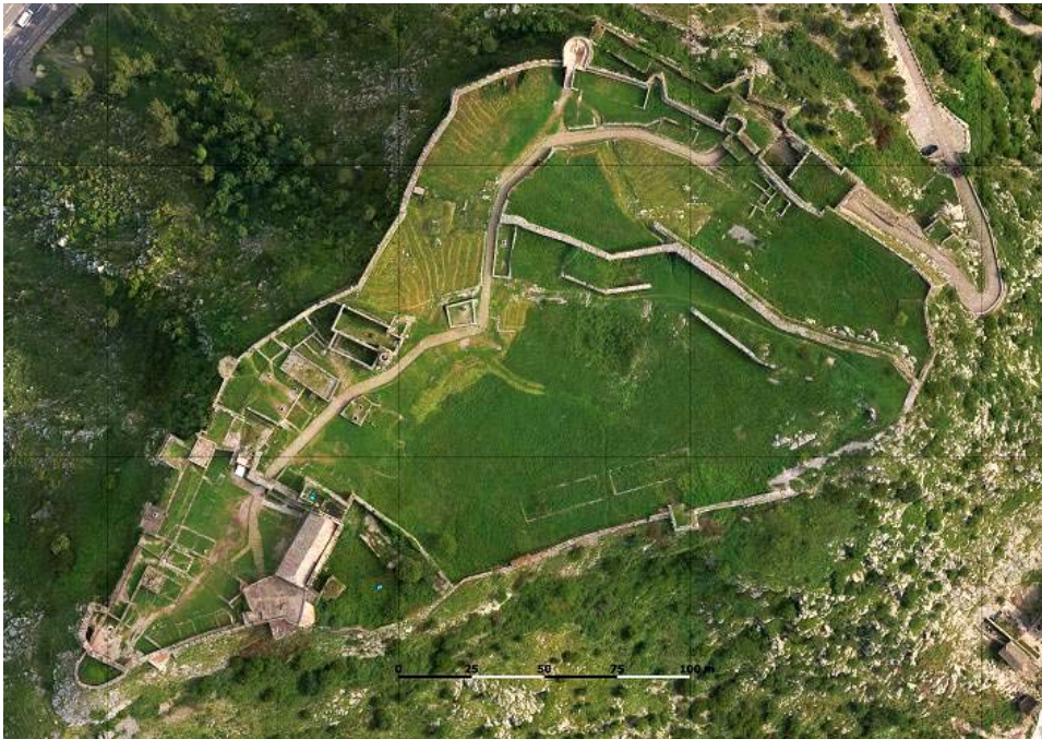
Fig. 8. Aerial view of fortress in Scoder