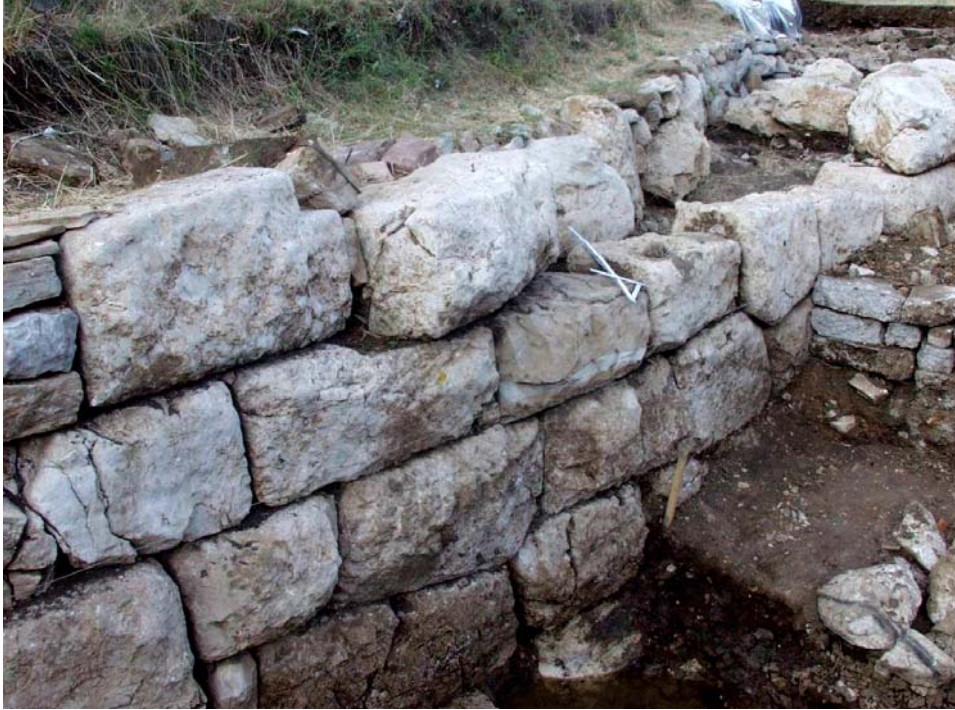
Fig. 3. Cyclopean wall of Rhizon