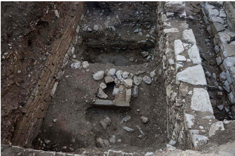
Fig. 6. So called "megaron" from Rhizon