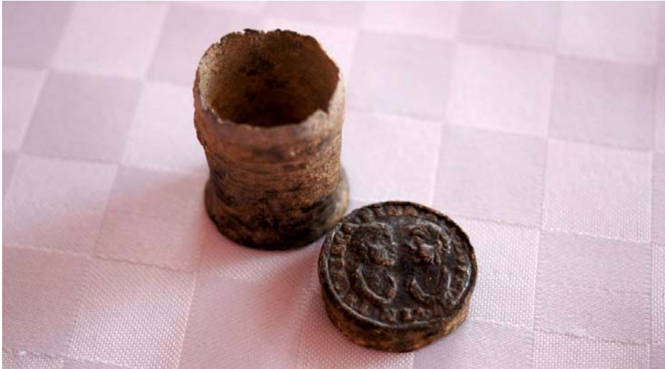
Fig. 12. Pyxis for thyriacum – Scoder