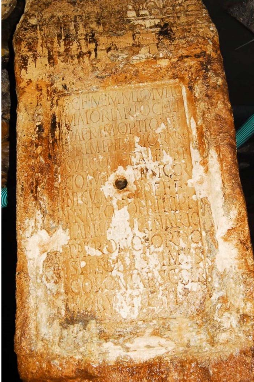
Fig. 9. Roman inscription from cistern – Scoder