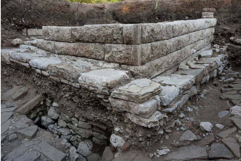
Fig. 5. Walls of representation building in place complex in Rhizon