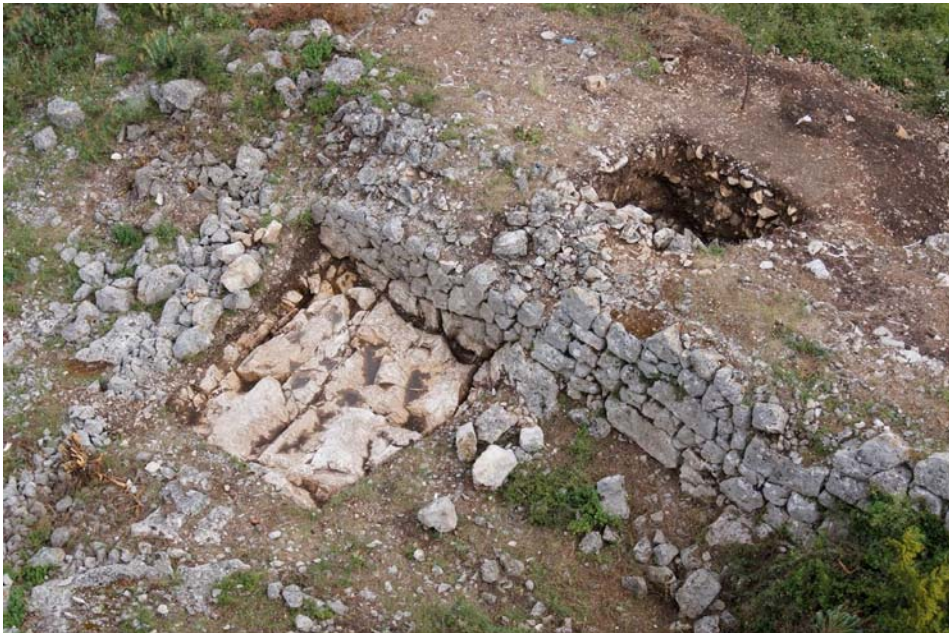
Fig. 11. Medieval wall – fortress of Scoder, photo P. Dyczek