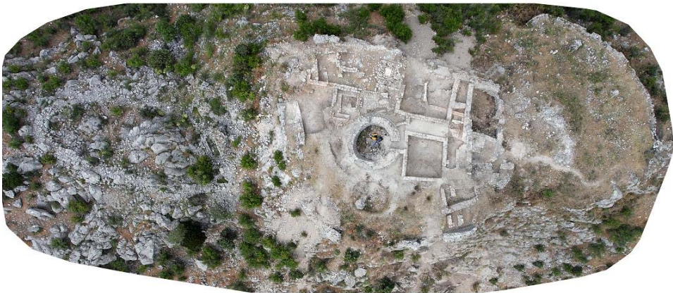
Fig. 4. Aerial view of Gradine – acropolis of Rhizon, S. Rzeźnik