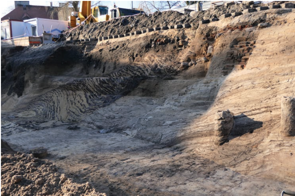
Fig. 2. Fragment of a stronghold's earth bank near Zagórze in Poznań