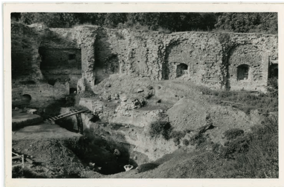
Fig. 3. The archaeological excavations conducted in the castle in Międzyrzecz in the 1950s.