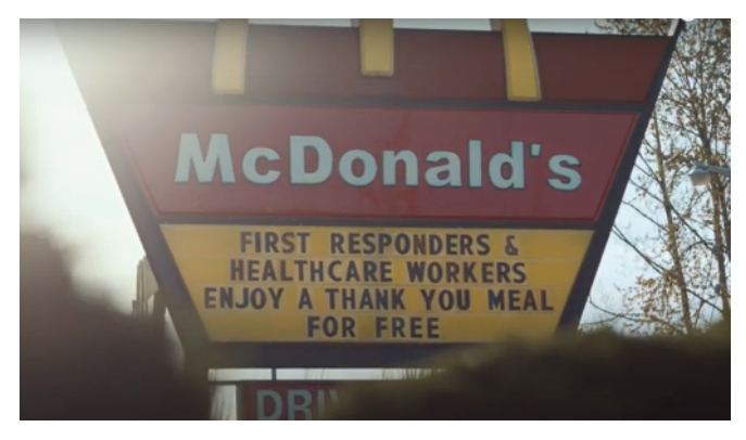
Picture 3. A shot from a spot for McDonald's Most important meals (IS5)

Similarly, McDonald's spot Most important meals highlights the importance of nurses' and doctors' work by stating: 'After billions and billions, THESE are the most important meals we've ever served' and declaring that some free meals for them will be offered (IS5). The spot finishes with a line: 'It's our honor to serve you', appreciating the courage and sacrifice of those at the front lines (see Picture 3).