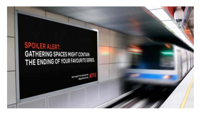
Picture 18. A shot from a spot for Netflix The Spoiler Billboard (IS18)

In order to play fair, however, ad makers warned people just before they boarded the ride into town with huge billboards containing spoiler alerts saying 'Gathering spaces might contain the ending of your favourite series' (see Picture 18).