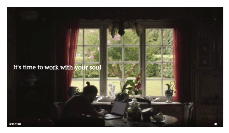
Picture 6. A shot from a spot for United Nations We are at home to protect you (IS10).

Even if the action took place in a daytime, there were no vivid, sharp colours that would be expected, but rather soft and dimmed, like in the spot for United Nations (IS10). Regardless of the object presented, everything seemed to be gray, black, as if a bit faded (see Picture 6). The lack of good contrast and low saturation made attention be directed to other components of the message, such as the values, which were underlined, or the general overtone.