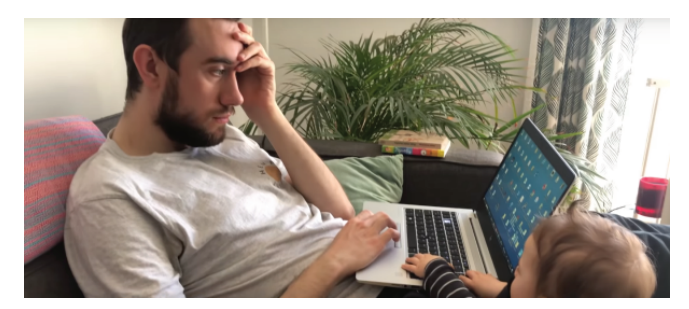
Picture 11. A shot from a spot for T-mobile Jesteśmy dla Ciebie (IS14)

As well as the changes in the way of filming, there was a novelty in terms of the heroes in commercials. The most frequently pictured types of people in TV commercial were experts, models, film actors and actresses. Enrolling celebrities to endorse the product has always been a popular strategy and basically all actors represented the most desired type of beauty and perfection. As one of advertising goals is to enchant, seduce and evoke desire, both men and women, regardless of the type, were good looking and attractive. However, with the onset of social isolation, when online learning and remote working started to be a daily routine, the characters changes into parents tired of taking care of children while working at the same time (see Picture 11), brave doctors, nurses, and other health care workers (see Picture 2), the elderly who need help, but, above all, common people representing 'just like us' type (see Picture 7, 11, 12, 13, 14, 15 and 16).