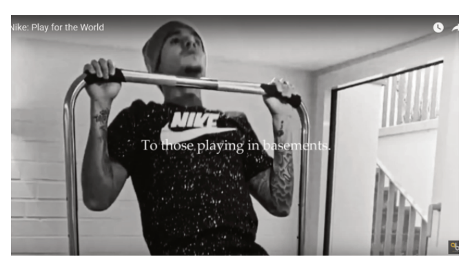
Picture 7. A shot from a black and white spot for Nike Play for the world (IS11)

The fact that all the pictures were monochromatic and presented along with meaningful slogans in white in between the clips helped to create a powerful message, which was additionally enhanced with nostalgic piano music.