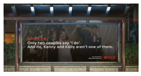
Picture 17. A shot from a spot for Netflix The Spoiler Billboard (IS18)

The last example to be discussed is Netflix commercial The Spoiler Billboard . It took the form which resembled a social campaign against going out in the times of lockdown. The commercial was targeted mainly at young Netflix users, for whom the need to meet their peers was the strongest and the moral obligation to stay home the weakest. The aim was to discourage people from going out by putting up bill-boards filled with spoilers from Netflix Originals in gathering spaces. The copy body said 'Some people still think it is ok to go out and chill, spoiling it for us all, so we took an extreme measure: we spoil their favourite Netflix shows' (IS18). The caption stated 'If the virus doesn't stop you from going out... The spoilers will'.