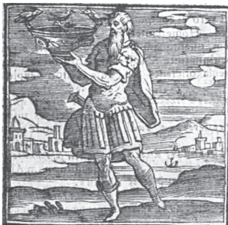
Figure 3. Nestor holding a cup - a fragment, according to Andreae Alciati emblemata , Patavii apud Petrum Paulum Tozzium, 1621, p. 423.