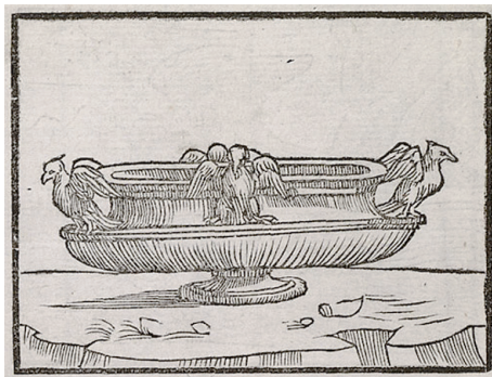
Figure 1. The shape of Nestor's cup – a fragment, according to Andreae Alciati Emblematum libellus nuper in lucem editus , Venetiis: Aldus 1546, fol. B1v.

As it turns out, the reflections included in Athenaeus' Deipnosophistae were widely discussed in the early modern era. The work's editio princeps was published in Venice at Aldus Manutius' printing office in 1514, and its second