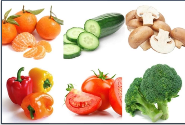
Figure 2 Receptive knowledge test example item. The figure illustrates the receptive knowledge test card for the target word cucumber

for all the CBI and PBI lessons were collected. The same versions of the two assessments were used for the pre-, post-, and delayed post-tests.