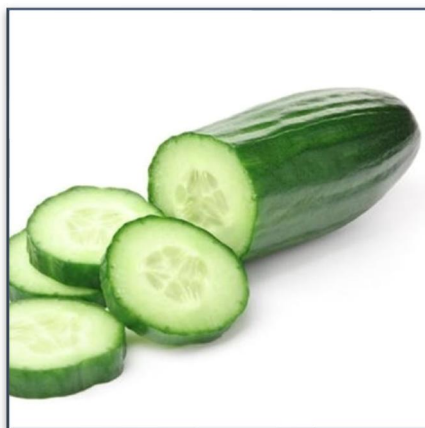
Figure 1 Productive knowledge test example. The figure illustrates a productive knowledge test flashcard for the target word cucumber

Data were collected at three points in time. Pre-tests for each topic were completed in the week before the intervention, post-tests were completed immediately after the intervention, and delayed post-tests took place 10 weeks after the intervention. The participants of all three groups followed the school's regular curriculum during the 10-week period before the delayed post-test; the topics used for the current study were not taught to any of the groups during this time.